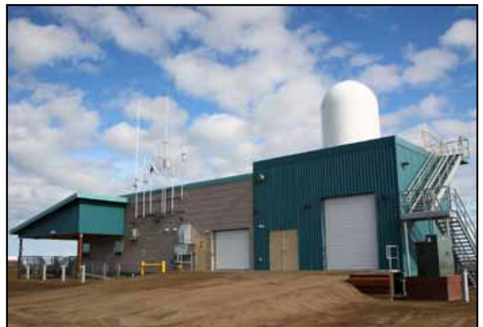
Barrow Weather Service Office and Upper Air Inflation Shelter facility.