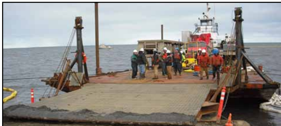
The MV Stryker onshore at Oliktok Point, Alaska.

The UIC Family of Companies is grateful to all persons and entities involved in the MV Stryker recovery. The operation was conducted in a manner that ensured the safety of all personnel, controlled sources of potential fuel release, and protected the area's wildlife and environment.