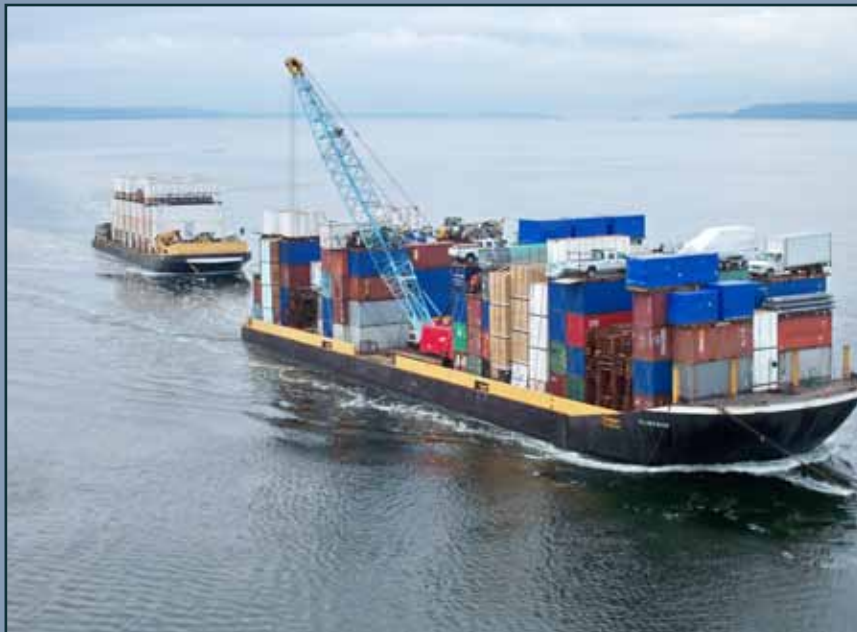
Line haul barge Klinkwan towing the Callapooya barge, on the first BTC sailing of the season. The barges departed Puget Sound on July 4 th carrying project freight for the Barrow hospital.

the company also safely transported over 30 vehicles, boats, ATVs, and snowmachines for shareholders. BTC would like to thank their hard working employees, many of whom are shareholders, shareholder descendants, and shareholder spouses. This record breaking 2010 season would not have been possible without their dedication and hard work.